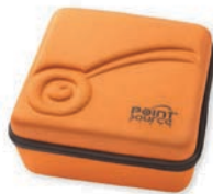
CM-CSE Premium Headset Storage Case, Orange