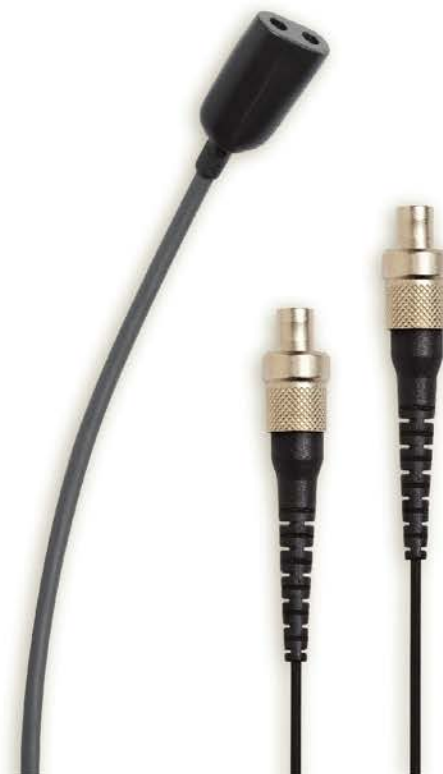
PHOTOS (TOP LEFT): AN EXAMPLE OF TRADITIONAL DOUBLE MIC'ING. (ABOVE): THE CO2-8WL, DESIGNED WITH BUILT-IN BACK-UP, IS TWO MICS IN ONE.